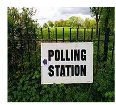
Supported Local, European and General elections.

For Workforce Transformation and as Best Commercial Council.